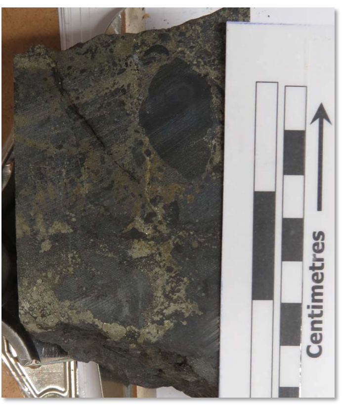
Brecciated argillaceous spiculite