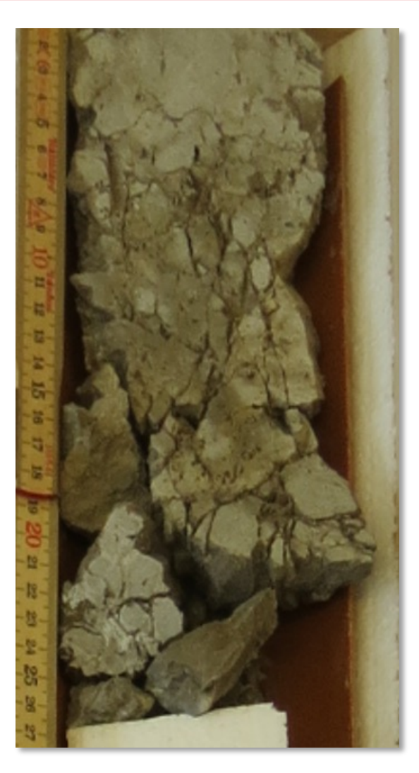
Crackle brecciated Ørn Fm